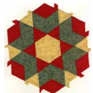
Sampler Quilt Week 2 Friday 29 th January