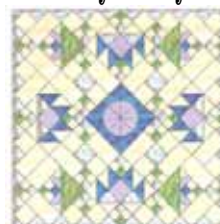
Lavender Blue Saturday 29 th May

Lavender Blue with Betty Croke. Approximately 50" square. A very pretty quilt in our example using purples and blue. Machine sewn. All Day 10.00am - 4.00pm