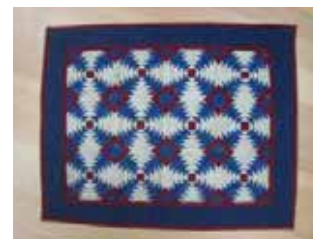
Miniature Pineapple Friday 25 th June