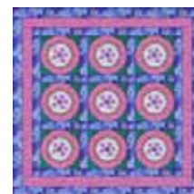
Snowball Saturday 8 th May

Snowball with Betty Croke. A quilt with a centre block that looks like a snowball. Machine sewn. All day 10.00am - 4.00pm