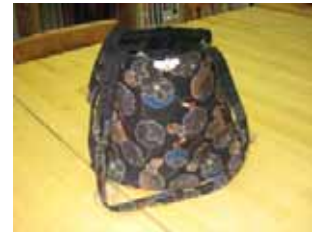
Double Bag Friday 22 nd January