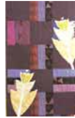
Journal Covers (Example of possibilities) Wednesday 14 th April

Nought and Crosses with Margaret Jenkins. A fractured nine-patch lap quilt which can be made with selected fabrics or as a stash buster. Quickly pieced, suitable for all levels including beginners. Machine sewn. All Day 10.00am - 4.00pm