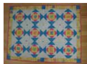
Butterfly Frolic Saturday 26 th June

We will close for Christmas at 4.30pm on Saturday 19 th December And Re-open at 9.30 am on Tuesday 5 th January 2010