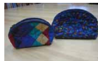
Small Purses Friday 5 th March