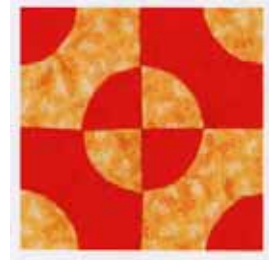
Sampler Quilt Week 5 Friday 12 th March

Suitable for all levels. Hand or machine sewn. All Day 10.00am - 4.00pm.