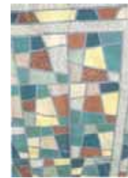
Magic Tiles Thursday 18 th March