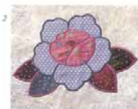
Sampler Quilt Week 10 Friday 18 th June