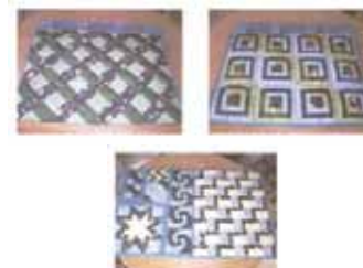
Quilters Work Bag Starting Saturday 6 th February