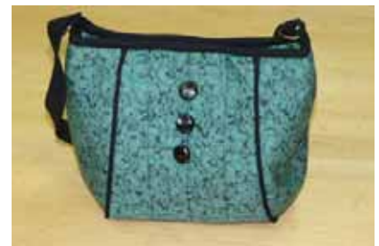
Shell Handbag Saturday 24 th April