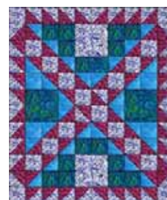
Star crossed Friday 11 th June

Star crossed with Betty Croke. A larger quilt with a distinctive star design across the centre. Machine Sewn. All Day 10.00am - 4.00pm