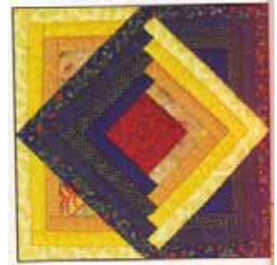
Sampler Quilt Week 1 Friday 15 th January

Suitable for all levels. Hand or machine sewn. All Day 10.00am - 4.00pm.