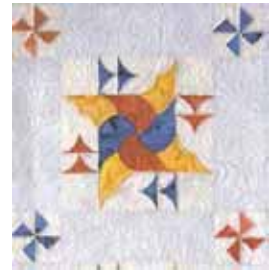
Sampler Quilt Week 7 (Example only) Friday 23 rd April