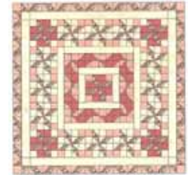
Windfarm Saturday 13 th March