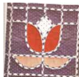
Sampler Quilt Week 4 Saturday 26 th February