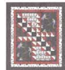
Black and White and Red all over Thursday 13 th May

Black and White and Red all over with Betty Croke. Approximately 51" x 59" in size. A great way to show off dramatic fabrics. Machine sewn. All Day 10.00am - 4.00pm.