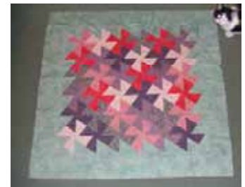
Flower Garden Saturday 23 rd January