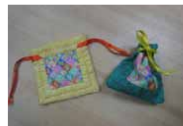
Easter Surprises Friday 5 th March