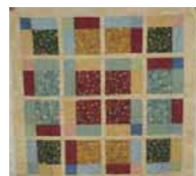
Noughts and Crosses Friday 7 th May