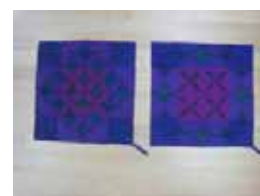
Cathedral Window/ Secret Garden Thursday 18 th February