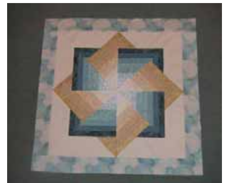
Strips Two Thursday 29 th April