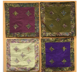
Friday 16 th February