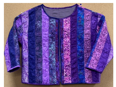
Thursday 21 st March

Jelly Roll Jacket with Judith Henshaw. With one jelly roll (or a selection of 2 1/2" strips) and a crew neck sweatshirt (one size larger than you would normally wear) make this 'quilt as you go' edge to edge jacket. Machine sewn. All Day 10.00am - 4.00pm.