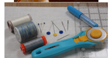
Saturday 17 th February