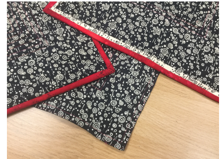
Friday 26 th January

Bindings with Alison Forbes. A half day course to cover the basics of bindings: wholecloth, double and no hand sew binding. Suitable for all levels. Machine Sewn. Half Day 10.00 am - 1.00pm.