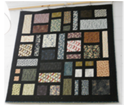
Wednesday 14 th February

Japanese Blocks with Alison Forbes. By popular demand we are putting on a course to make our much admired display quilt. Suitable for all levels. Machine Sewn. All Day 10.00am - 4.00pm.