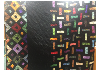
Wednesday 13 th March

Move from one block to another with a transition of perle stitching. You can make a small or double sized quilt. Suitable for all levels. All Day 10.00am - 4.00pm.