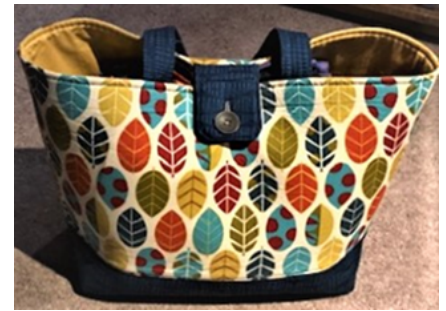
Friday 19 th January

Carry All Bag with Judith Henshaw. A handy and strong bag that really can be used to carry all your shopping, workshop needs or even essentials for a night away. It has a sturdy bottom, strong handles and an internal zipped pocket. It's a great introduction to bag making or just a bag to add to your collection of bags! Suitable for all levels. All Day 10.00am - 4.00pm.