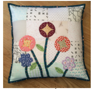
Saturday 2 nd March

Skill Building Flowers cushion with Lucy Brennan. This class covers a lot! Patchwork, English Paper Piecing, Quilting and Appliqué combine to create a modern and beautiful design. Suitable for all levels, even those new to hand sewing. Hand Sewn. All Day 10.00am - 4.00pm.