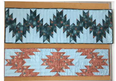
Friday 15 th March

Both of these runners are made using the same block and can be lengthened or shortened. A border could also be added. Some experience needed. Machine sewn only. Finished sizes - blue 15" x 47", pink 12 1/4" x 45 1/2". All Day 10.00am - 4.00pm.