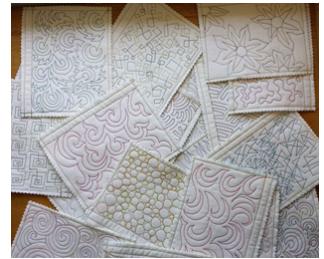
Saturday 3 rd February

Machine Quilting Part 2 with Lucy Brennan and Alison Forbes. Plan your quilting and put it into practice. In this second class we will expand on basic quilting patterns and will cover the use of stencils, marking and practise free motion quilting. You can bring a quilt top to the class (optional) and leave feeling confident about the quilting. The two day course will give you confidence in your quilting. Machine Sewn. All Day 10.00am - 4.00pm.