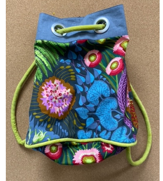
Friday 9 th February

Bucket Bag/ Back Pack with Judith Henshaw. A bucket style bag with large feature eyelets. Choose from a rouleau or regular flat strap. Carry it over your shoulder or convert it into a backpack. Machine sewn. All Day 10.00am - 4.00pm.