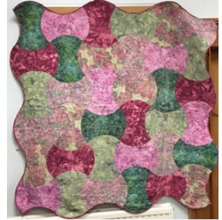
Saturday 9 th March

Much easier than it looks and has a lovely curved edge finish. Some experience needed. Hand or machine sewn. Finished size 56" x 56". All Day 10.00am - 4.00pm.