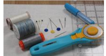
Saturday 15 th October