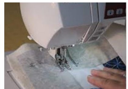
Saturday 5 th November