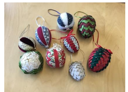
Friday 21 st October

Folded Christmas Decorations with Jan Otty. Easily made with folded fabric pinned to polystyrene shapes. Could be good for presents? All Day 10.00am - 4.00pm.